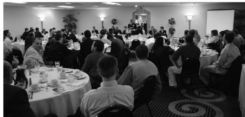
The 2004 Alumni Breakfast was a well attended event, with over 100 alumni and members joining together for breakfast and fellowship.

I do not believe we will end up like other organizations, nor do I believe we will one day be content to be average. The very thought that the word "mediocre" and "Upsilon" would be mentioned together—to me is repulsive. I call on everyone associated with Upsilon Xi to consider becoming more involved. In the end, we may be the only club left standing, but as I see it, we've been alone at the top already for a very long time. Staying there takes hard work