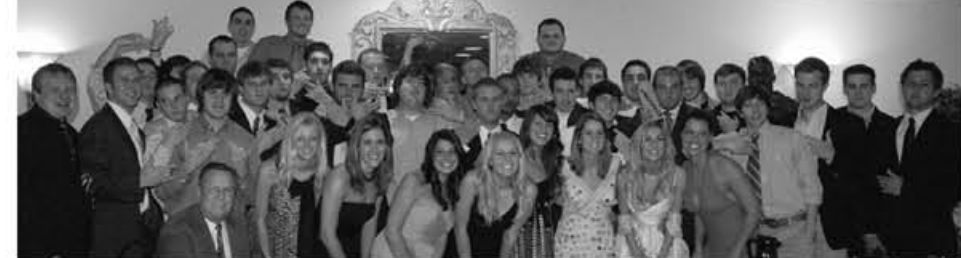
Upsilon Spring Formal 2007