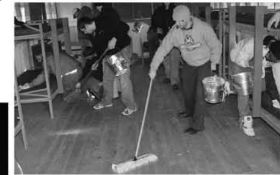
Upsilon Xi inductees learn that Upsilon is a lot more than a jersey, but service.