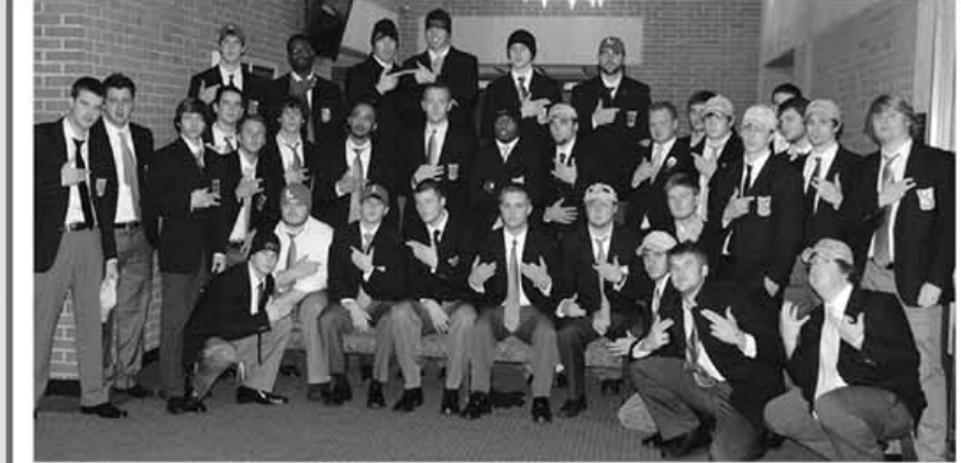
Upsilon has grown through the years. This photo was taken Spring 2007.

Our goal is $4500.00 in alumni dues or 45 individuals give 100 in dues for every year of Upsilon or 100 individuals give 45 in dues for every year of Upsilon Let's surpass our goal and prepare for the 50th Anniversary of Upsilon Xi, now. Look inside for more information