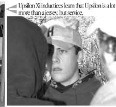
Upsilon Xi inductees learn that Upsilon is a lot more than a jersey, but service.