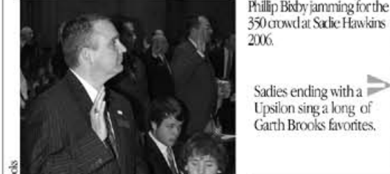
Sadies ending with a Upsilon sing-a-long of Garth Brooks favorites.