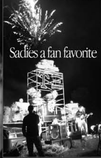
Sadies a fan favorite

Strong and still growing... like a hickory